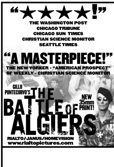
1 col. x 3" = 3"