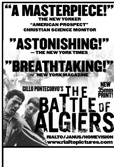
1 col. x 3" = 3"